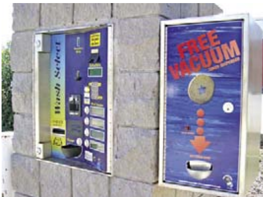
Dispensing tokens at IBA cashiers facilitate “FREE Vac” offers, and other enticing freebees too.