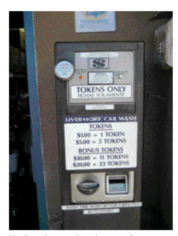
Vending tokens can be a time saver for the operator.

What you do with the "found time" that was formerly devoted to emptying coin boxes is up to you—but that time can be multiplied if you also count your quarters in addition to emptying the coin boxes. While many operators handle the counting of quarters, this is another task that can be delegated to employees with a token-only system—since there is less temptation for employees to swipe tokens than cash. If you accept quarters in addition to tokens (this can account for a sizable portion of car wash sales), you may prefer to continue to sort and count your quarters—because you are only counting the quarters not the tokens.